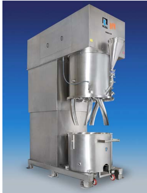
Ross Double Planetary Mixer